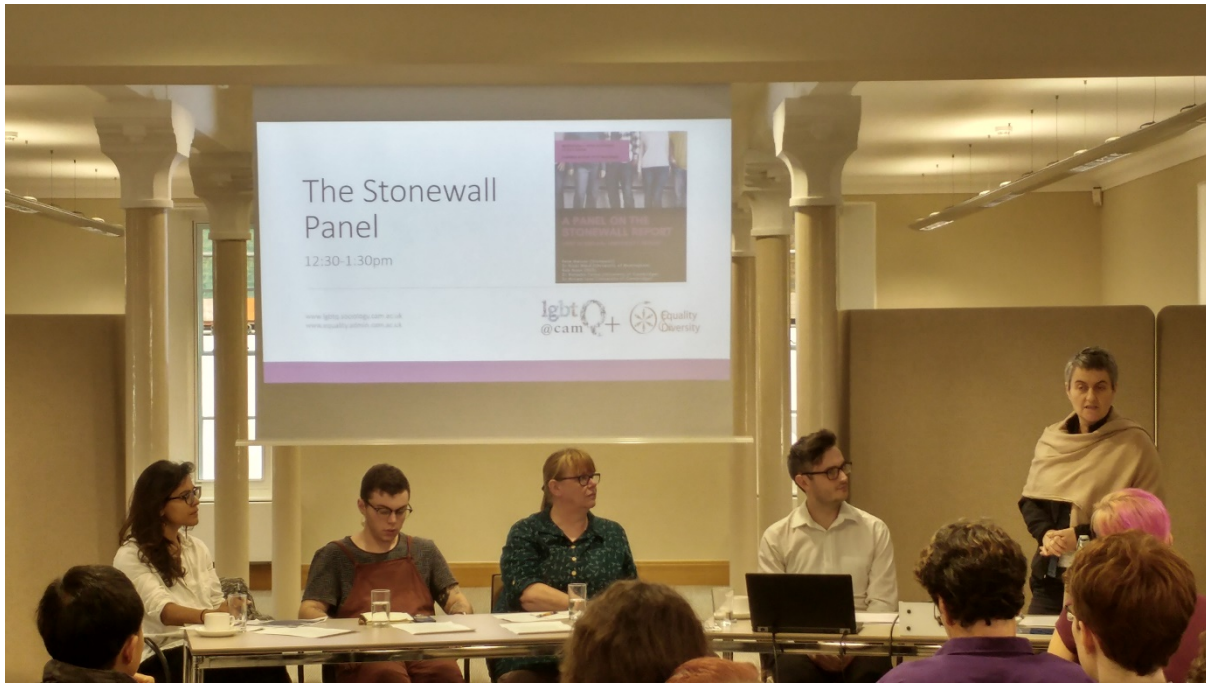
Stonewall panel, co-organised with Equality&Diversity: October 2018