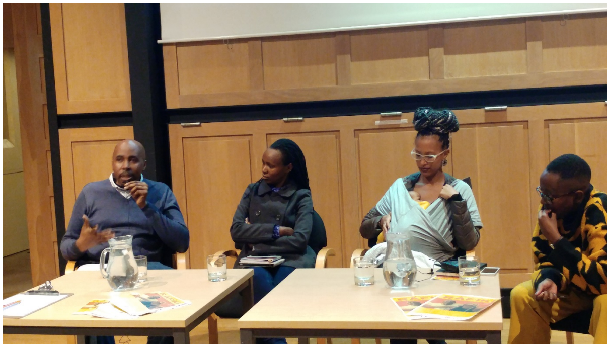
'Rafiki' panel: November 2018

In March 2018 IgbtQ+cam successfully bid for funding from CRASSH for 'Beyond Binary', a major conference scheduled for March 2019 keynoted by leading LGBTQ+ scholar Susan Stryker. IgbtQ+@cam is also co-hosting the public event with Jackie Kay and Angela Davis on 23 April 2019. A major LGBTQ+STEMM conference is being co-