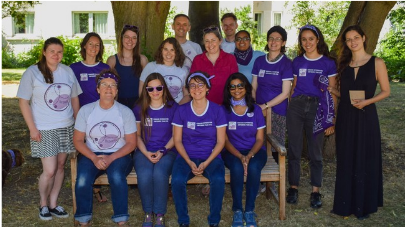
The Remaking Reproduction Conference Team was in full swing (and partial uniform) as we prepared for our conference last Spring.

fascinating podcasts, reflections, photos and other conference documentation resulting from this landmark event for our field is now available on our 'MOCA', or Massive Online Conference Archive.