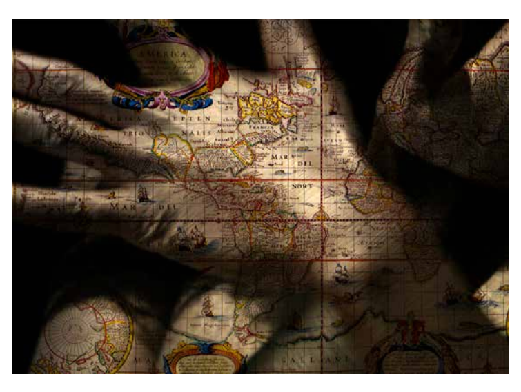
PROGRAMME INTERNATIONAL CONFERENCE 2–3 SEPTEMBER 2016